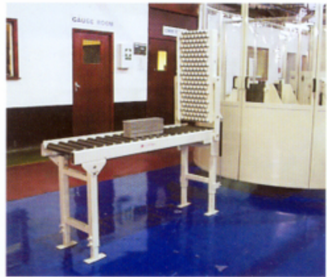
INFED TRACK with gas assisted lift-up ball section to allow operator access.