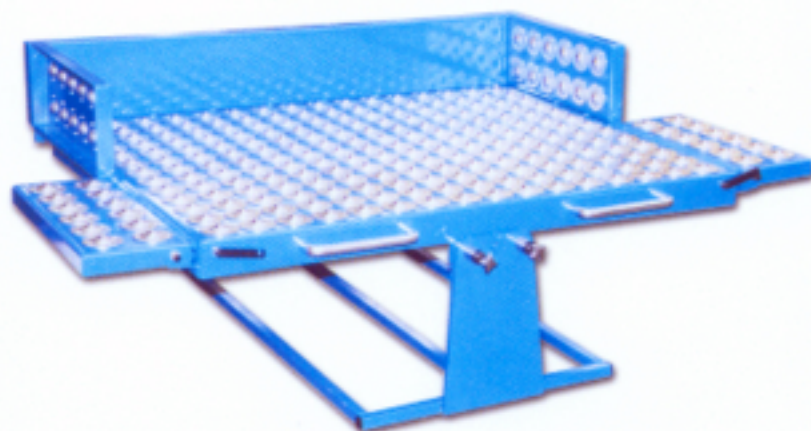
TILTING BALL TABLE manufactured to fit onto a scissor lift trolley for order picking.

SCISSOR LIFT TROLLEY. With specially fabricated Live/Dead top enabling ball units to be raised and lowered pneumatically for safe transport of heavy items. The example shown was for handling injection moulding tools.