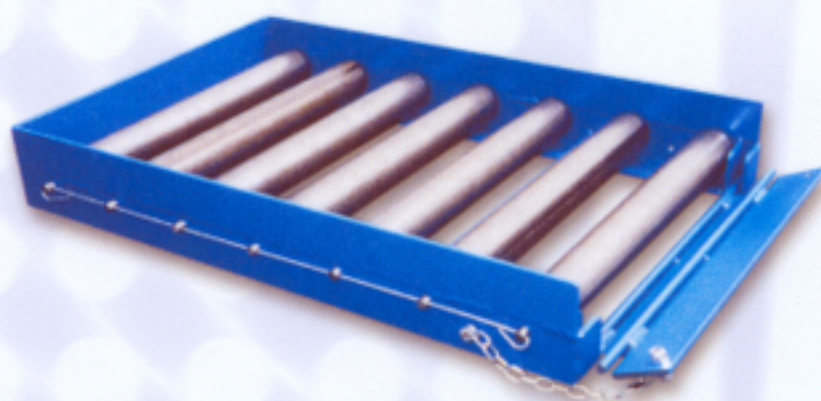
GRAVITY ROLLER TRACK. Consisting of steel rollers in rolled steel angle with side guards and drop down front guard. This was supplied to fit on to a scissor lift trolley.