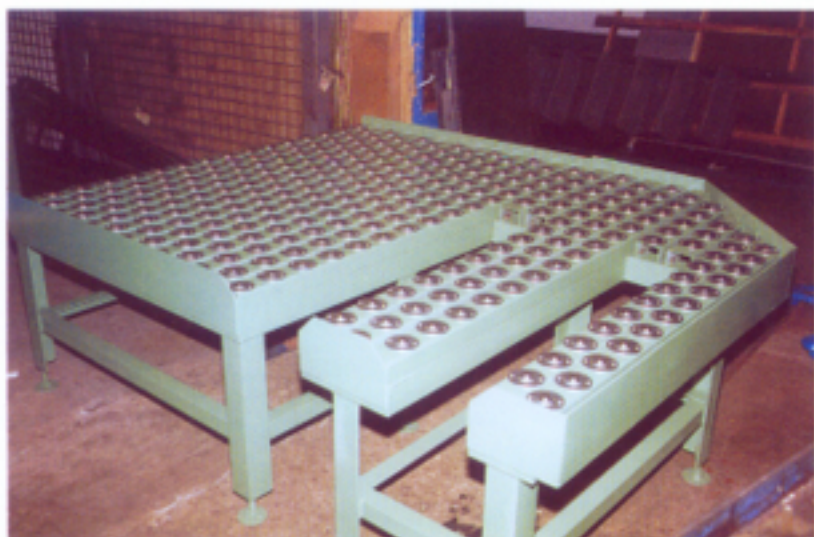
BALL TABLE with fork lift truck access for handling large press tools.

We can also supply special Die Tables, Racking and Handling Systems.