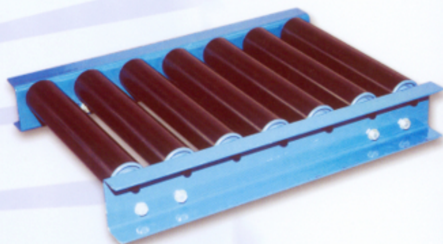
GRAVITY ROLLER TRACK. Consisting of high impact plastic rollers in pressed steel sideframes.

We can offer project management, system design and installation from initial enquiry to final commissioning. Whether an order is for one replacement roller or a complete system, our aim is to provide you with the right equipment at the right price.