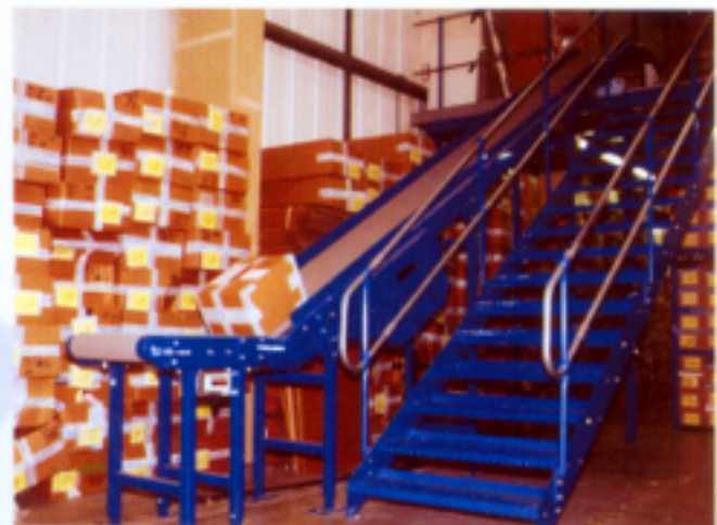
BELT CONVEYOR to mezzanine floor to aid storage.