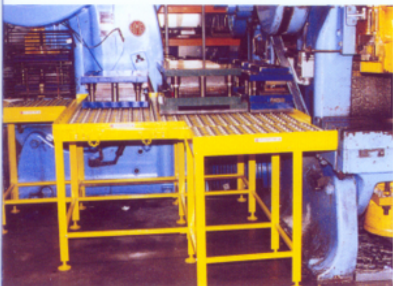
Ball Table for S.M.E.D. Tool change for Automotive Supplier.

LIVE STORAGE RACKING. For use when quick turnaround of stock is required.