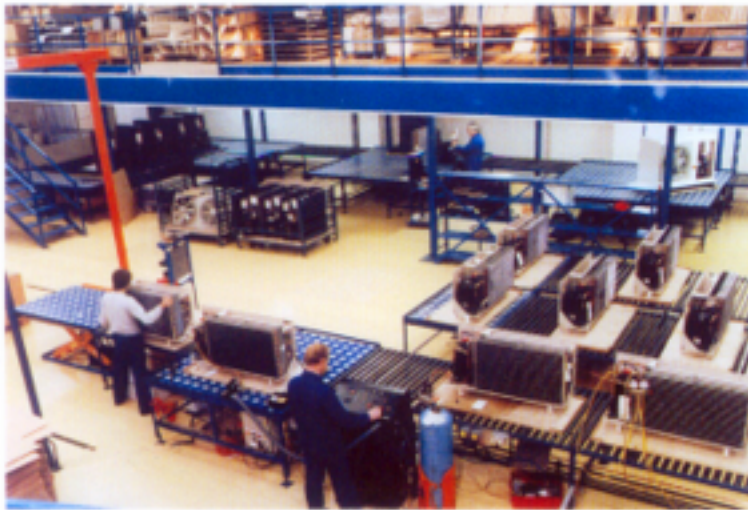
ROLLER TRACK AND BALL TABLE SYSTEM for a manufacturing facility.