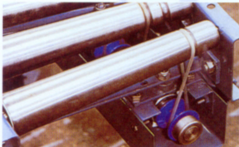
LINESHAFT ACCUMULATION CONVEYOR to handle large batches of components.